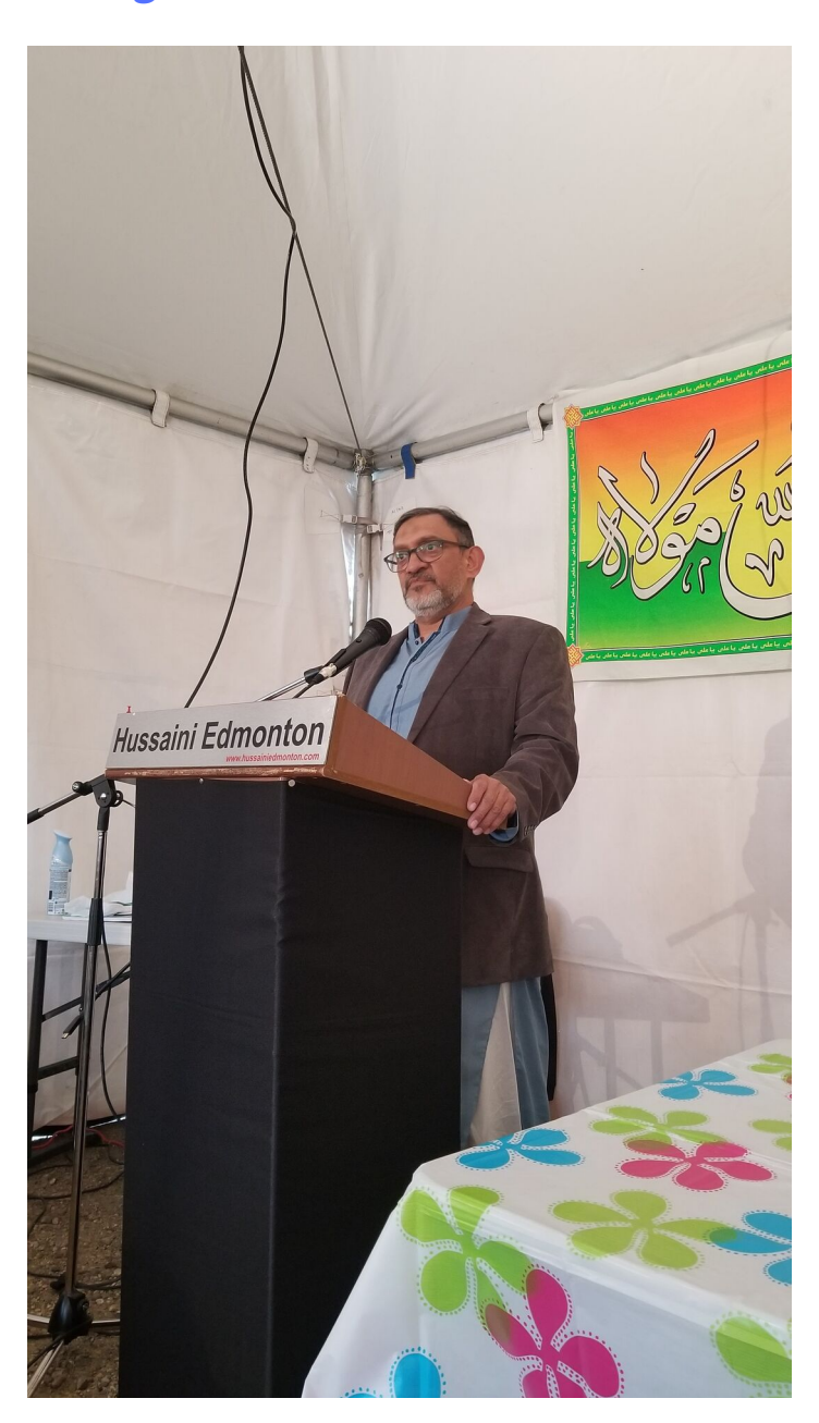
United Ghadeer - August 2019