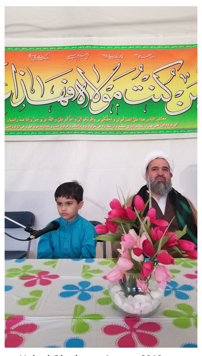
United Ghadeer - August 2019