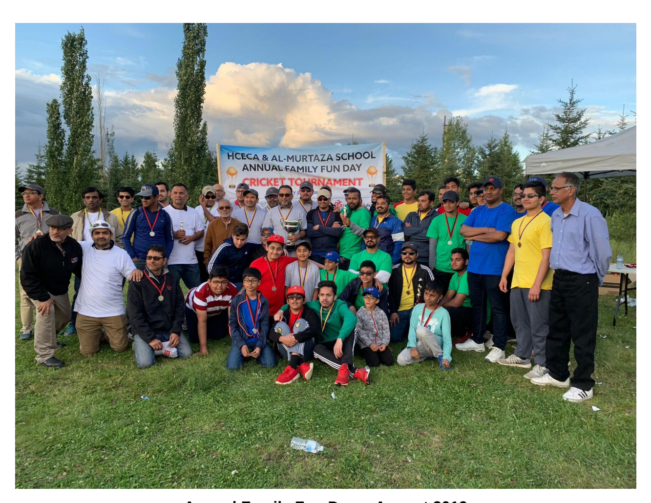
Annual Family Fun Day - August 2019