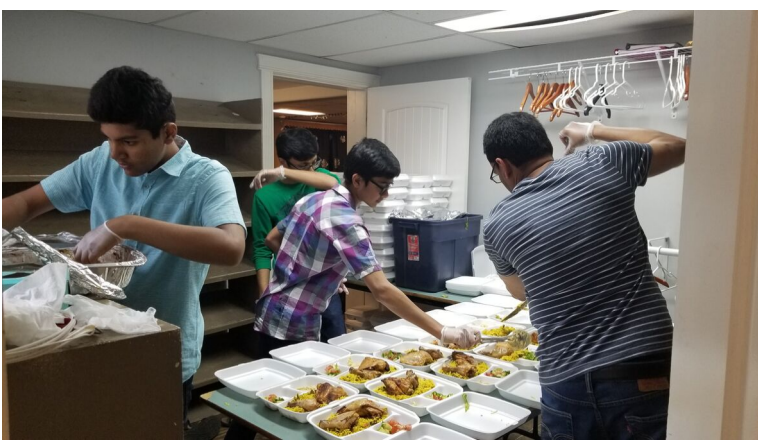
United Ghadeer - August 2019