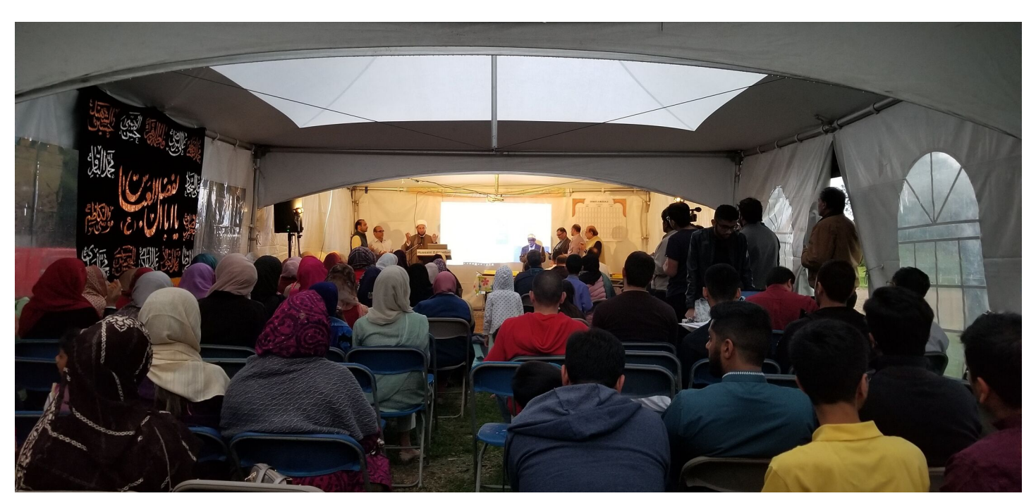
United Ghadeer - August 2019